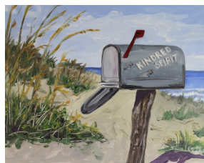
“Kindred Spirt Mailbox”